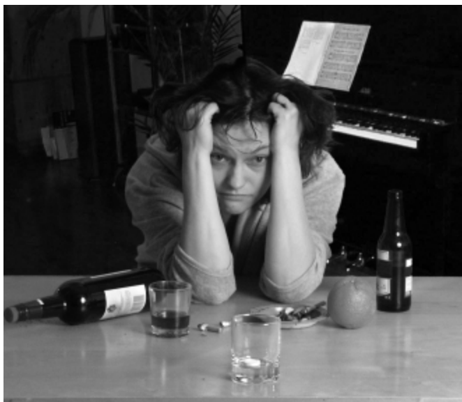
Sunday morning breast cancer?

6% of what? This is clearly quite ambiguous. What this one sentence misses is that the 6% is associated with having an extra drink every day for the rest of your life, and that if there is normally a 9% risk of being diagnosed with breast cancer before you are 80, then drinking every day for the rest of your life raises this by 6%. But 6% of 9% is 0.54% — the new overall risk is actually now only 9.54%. What seemed like a massive risk increase is indeed quite small (only 0.54%) and would require you to drink a lot of alcohol.