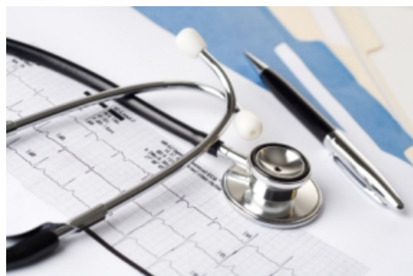
Medical maths - it's vital to get it right.

As an example, take the group of physicians who were asked what the chance of a patient truly having breast cancer was, given that the test has a 90% chance of accurately spotting the cancer if you do have it, and a 93% accuracy of a correct reading if you do not. The extra information is that 0.8% of the sample in question (women between 40 and 50 years of age), actually have breast cancer. The immediate thought that springs to mind is, "well, it must be 90%" and a lot of the physicians snatched at this number.