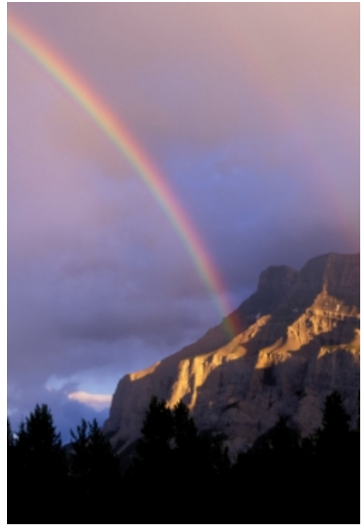
This rainbow is white - on average.

Just as averages can distort in favour of extremes, extremely large numbers can glamourise things that are average at best. We are nicely evolved to deal with numbers that are small enough to be counted, but 10 zeros on the end of a number can make it incomprehensible — and make somebody look very generous. Take for example the numbers bandied around by the government for public spending. The UK Labour government proposed a £300 million fund over 5 years to provide one million new childcare places. This seems a huge amount for a very noble cause. But some simple arithmetic suggests otherwise. The amount equates to £300 per new childcare position over the five years. This then is £60 per year or £1.15 per week per child. Can you really fund childcare with this amount? No-one that we know pays that little!